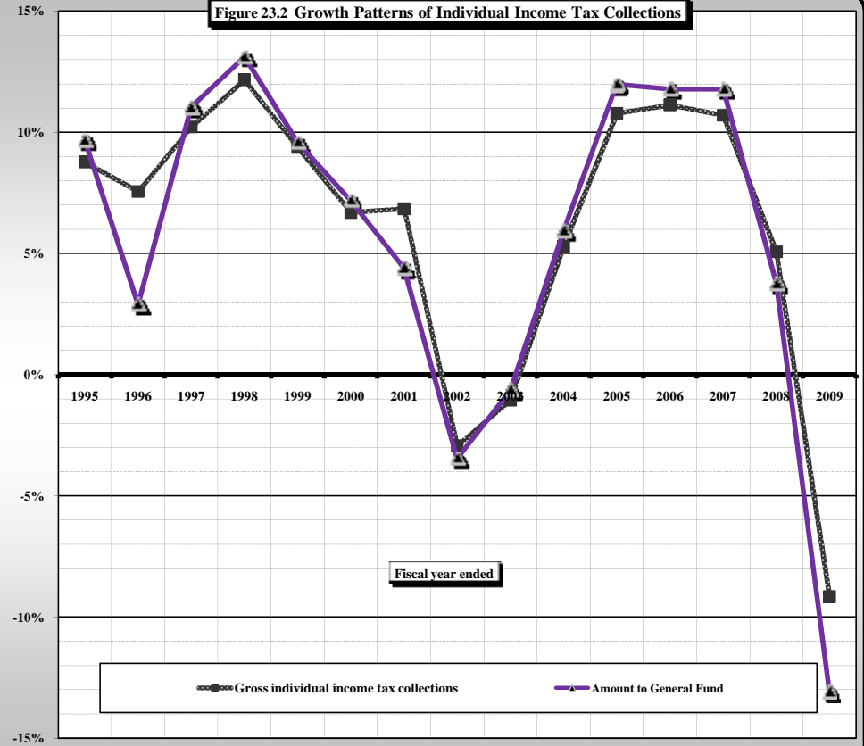
Figure 23.2 Growth Patterns of Individual Income Tax Collections