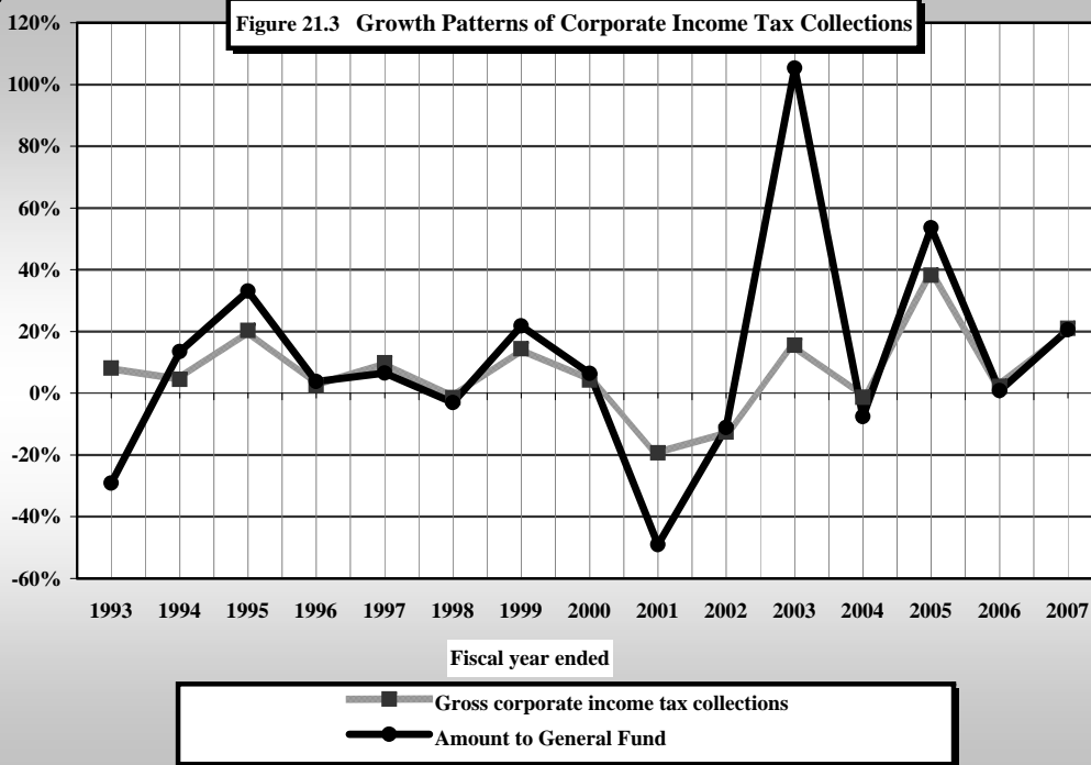
Figure 21.3 Growth Patterns of Corporate Income Tax Collections