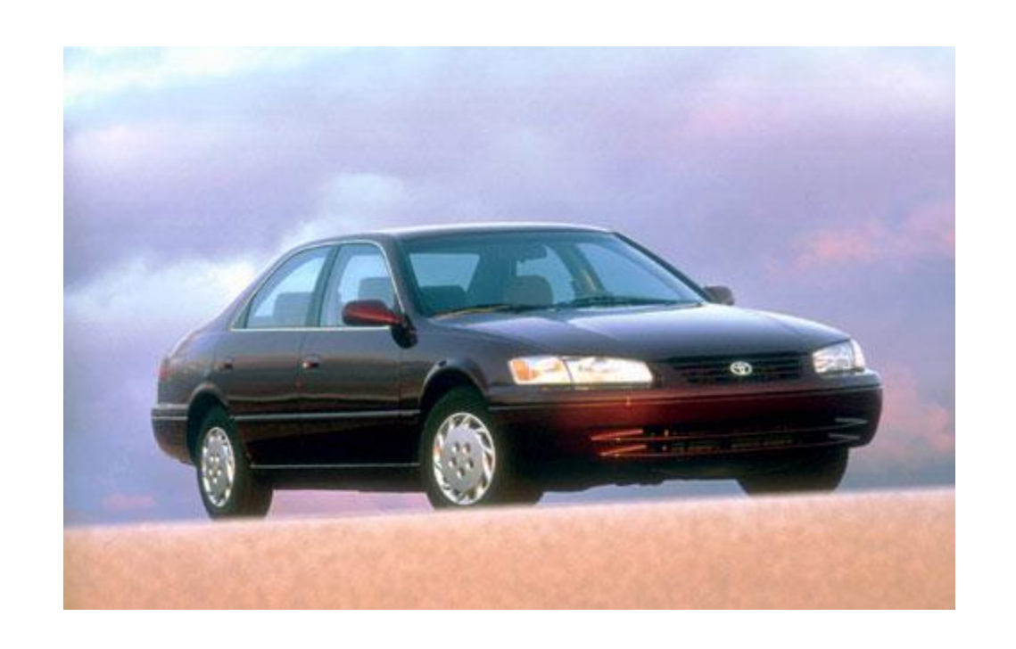
1999 Toyota Camry